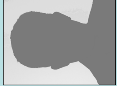
Shabaj 'Baz' Ali Supervisor (temporary) 214 6567